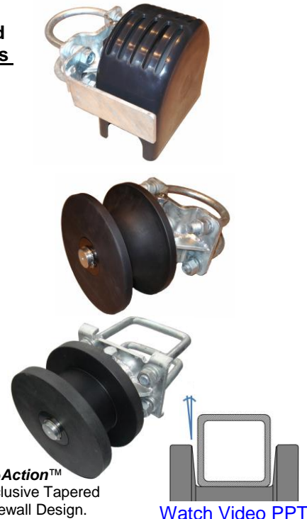
ProAction™ Exclusive Tapered Sidewall Design.

ProAction™ Technology Patent Pending ProAction™ Technology Patent Pending