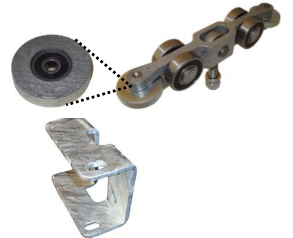
Bracket and bottom guide rollers fit 4" round or SQ posts depending on U bolts.